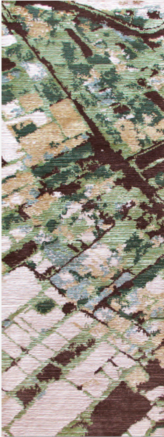
BENNETT BEAN STUDIO Aerial Tibetan wool and silk, hand-knotted, 100 knots per square inch, runner: 7' x 2.5', available in custom sizes, 2008.