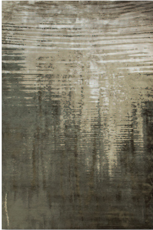
TANIA JOHNSON Ripples Wool and silk, hand-knotted 200 knots per square inch, made to order dimensions, 2012. Made in Nepal.

silk dyed the same color or pair looped and cut pile together. “We also use more colors in each knot—twisting multiple strands of varying tones or materials together—to achieve a specific look.” In addition, they use “orphans,” which are single knots of color that stand alone in a field of another color. While this may take longer to design and weave, they believe that the orphans improve the final product.