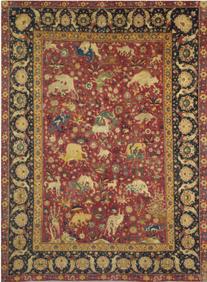
Silk Animal Carpet Silk (warp, weft and pile), asymmetrically hand-knotted pile, 94.88" x 70.1", made in Iran (probably Kashan) during the second half of the 16th century.